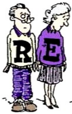
IT WON'T BE THE SAME WITHOUT U!!