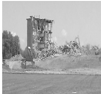
Esse Quam Videri!